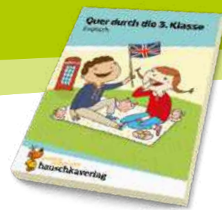
673 Primary school Block – Fun with English! Exercises for Primary school