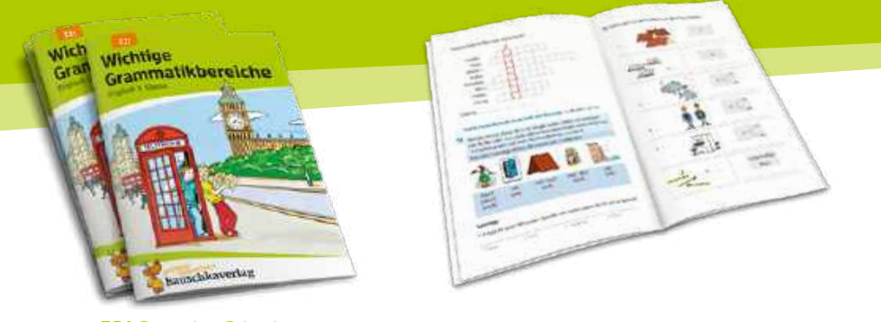
321 Secondary School Important Grammar – 1<sup>st</sup> year of English