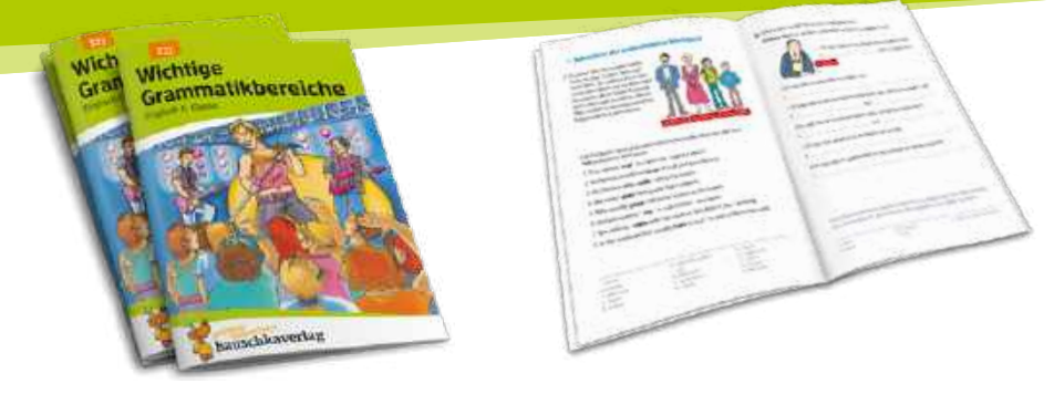
322 Secondary School Important Grammar – 2<sup>nd</sup> year of English