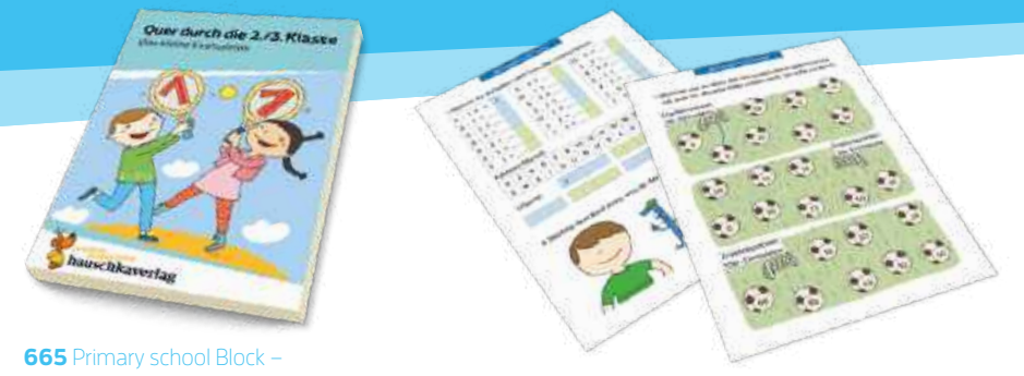
Fun with times tables! Years 2 and 3