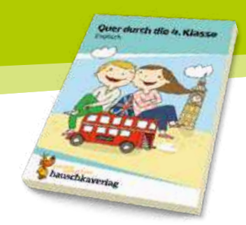
674 Primary school Block – Fun with English! Exercises for Primary school