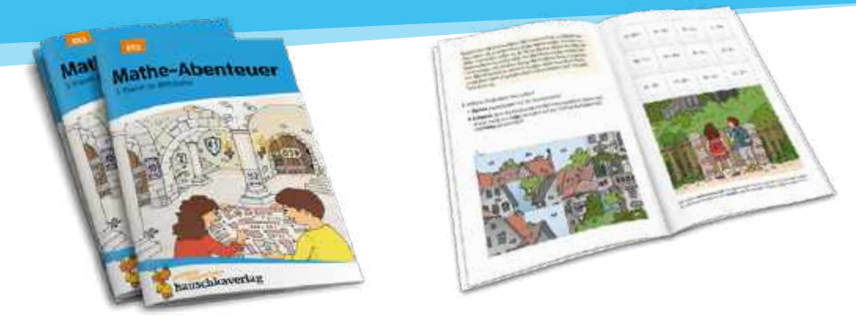
653 Primary school – Maths adventure – Journey to the Middle Ages