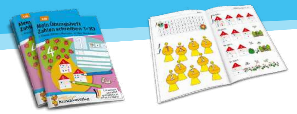
430 My exercise book for writing numbers 1-10 -