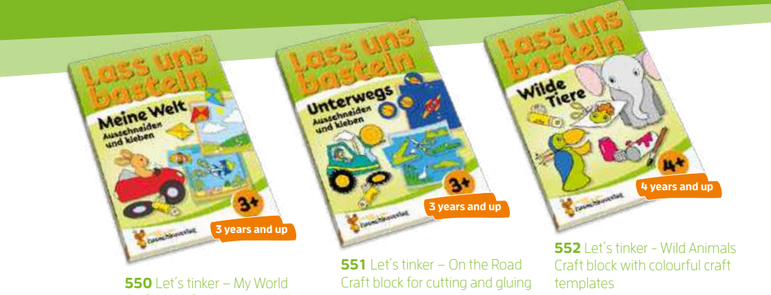
Watch out, it's time to get crafting!

These colourful craft blocks open up a whole new world of crafting for children aged 3-5! Some craft ideas require nothing more than scissors and glue. Others require additional craft materials that are often found in the household, such as toilet paper rolls, toothpicks, straws or ice-cream sticks. So you don't need much preparation time and can get started straight away! The craft blocks also encourage creativity and concentration as well as training fine motor skills. Have fun crafting together!